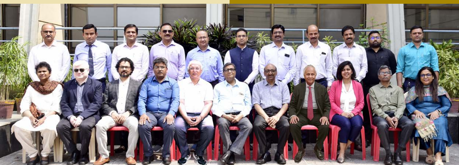
Managerial Leadership and Conflict Resolution (February 2024)